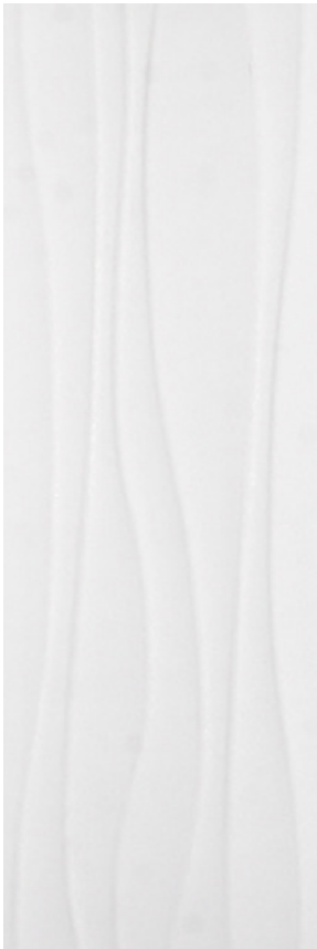
20x60 cm (7.88 x 23.63) IV.LG.WHT.0824.WV