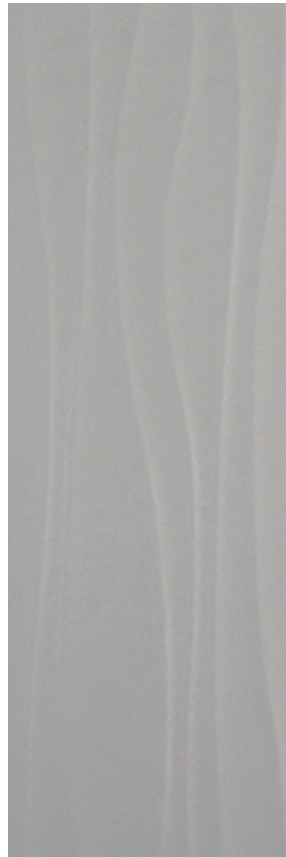
20x60 cm (7.88 x 23.63) IV.LG.SIL.0824.WV