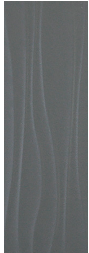
20x60 cm (7.88 x 23.63) IV.LG.GRY.0824.WV

All items shown in this document are part of Olympia's stocking program. For special orders, please contact your Olympia Tile Sales Representative.